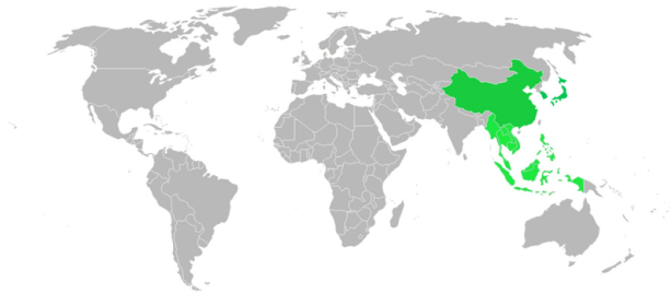
ASEAN Plus Three

Even more important, these countries have built up financial reserves by running massive trade surpluses, an objective they have achieved by keeping their currencies undervalued. Between 2001 and 2005, according to Nobel laureate Joseph Stiglitz, eight East Asian countries -- Japan, China, South Korea, Singapore, Malaysia, Thailand, Indonesia, and the Philippines -- more than doubled their total reserves, from roughly $1 trillion to $2.3 trillion. China, the leader of the pack, is estimated to now have over $900 billion in reserves, followed by Japan.