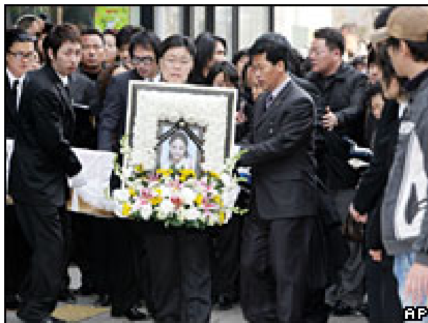
The suicide of a successful South Korean actress brought the spiraling suicide rate to public attention in 2007

The IMF has touted Korea as a "success story." However, Koreans hate the Fund and point to the high social costs of the so-called success. According to South Korean government figures, the proportion of the population living below the "minimum livelihood income" -- a measure of the poverty rate -- rose from 3.1 per cent in 1996 to 8.2 per cent in 2000 to 11.6 per cent in early 2006. The Gini coefficient that measures inequality jumped from 0.27 to 0.34. Social solidarity is unraveling, with emigration, family desertion, and divorce rising alarmingly, along with the skyrocketing suicide rate. "We have one big unhappy society that looks back to the pre-crisis period as the golden age," says Chang.