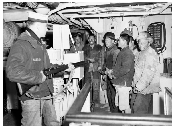
The Canadian destroyer HMCS Nootka arrested Korean fishermen off the west coast of Korea, May 1951.