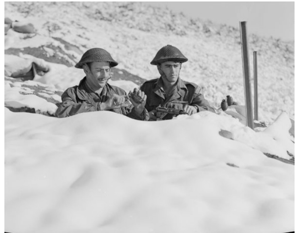
Canadian soldiers on patrol in Korea, December 1952.

Much of the resulting research, published in previous articles and in chapter ten of Orienting Canada , documents how the US government, with Canadian support, manipulated the United Nations to create a separate republic in south Korea and examines the subsequent events that led to full-scale war on June 25, 1950. 15 Lester Pearson, Canada's foreign minister at the time (and later prime minister), afterwards conceded that the war had nothing to do with defending democracy. The Canadian decision to send military forces reflected the determination of Pearson and the prime minister, Louis St. Laurent, to cement their continental alliance with the United States and their belief that East Asia was a US 'sphere of influence.' As a result Canada sent the third largest military contingent to Korea (after the US and United Kingdom) despite initial reservations. 16