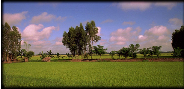
The Mekong Delta, the rice basket of South Vietnam