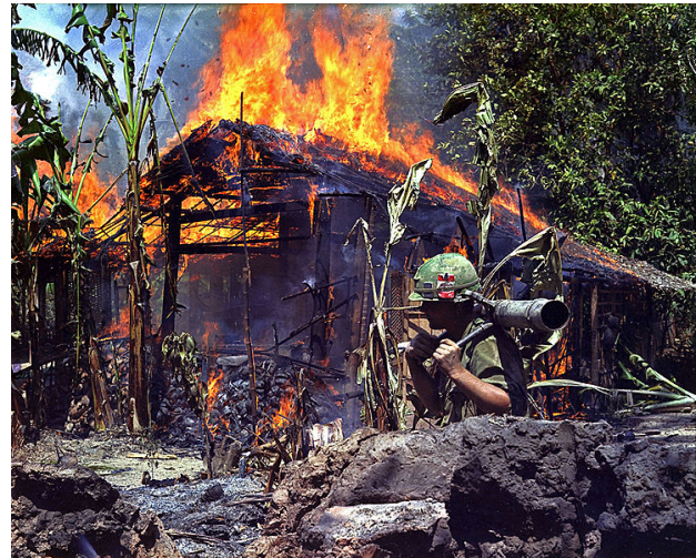
Burning a "Viet Cong base camp" in the Mekong delta, June 3, 1968 at Cai Lay

In this letter, and two more sent the following year to other high-ranking generals, the sergeant reported that artillery, airstrikes and helicopter gunships had wreaked havoc on populated areas. All it would take, he said, were a few shots from a village or a nearby tree line and troops would "always call for artillery or gunships or airstrikes." "Lots of times," he wrote, "it would get called for even if we didn't get shot at. And then when [we would] get in the village there would be women and kids crying and sometimes hurt or dead." The attacks were excused, he said, because the areas were deemed free-fire zones.