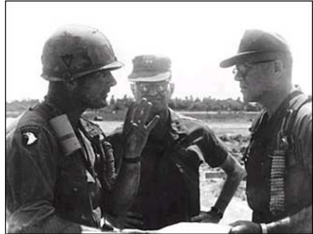
Col. David Hackworth briefs Gen. Julian Ewell (right)

An inkling that something terrible had taken place in the Mekong Delta appeared in a most unlikely source--a formerly confidential September 1969 Senior Officer Debriefing Report by none other than the commander of the Ninth Division, then Maj. Gen. Julian Ewell, who came to be known inside the military as "the Butcher of the Delta" because of his single-minded fixation on body count. In the report, copies of which were sent to Westmoreland's office and to other high-ranking officials, Ewell candidly noted that while the Ninth Division stressed the "discriminate and selective use of firepower," in some areas of the Delta "where this emphasis wasn't applied or wasn't feasible, the countryside looked like the Verdun battlefields," the site of a notoriously bloody World War I battle.