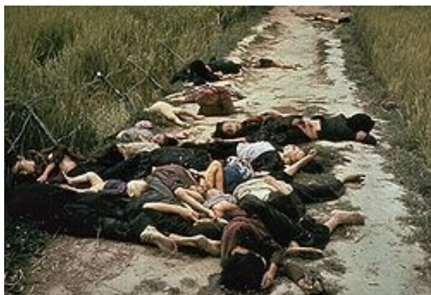
My Lai victims

In late 1969 Seymour Hersh broke the story of the 1968 My Lai massacre, during which US troops slaughtered more than 500 civilians in Quang Ngai Province, far north of the Delta. Some months later, in May 1970, a self-described "grunt" who participated in Speedy Express wrote a confidential letter to William Westmoreland, then Army chief of staff, saying that the Ninth Division's atrocities amounted to "a My Lay each month for over a year." In his 1976 memoir A Soldier Reports , Westmoreland insisted, "The Army investigated every case [of possible war crimes], no matter who made the allegation," and claimed that "none of the crimes even remotely approached the magnitude and horror of My Lai." Yet he personally took action to quash an investigation into the large-scale atrocities described in the soldier's letter.