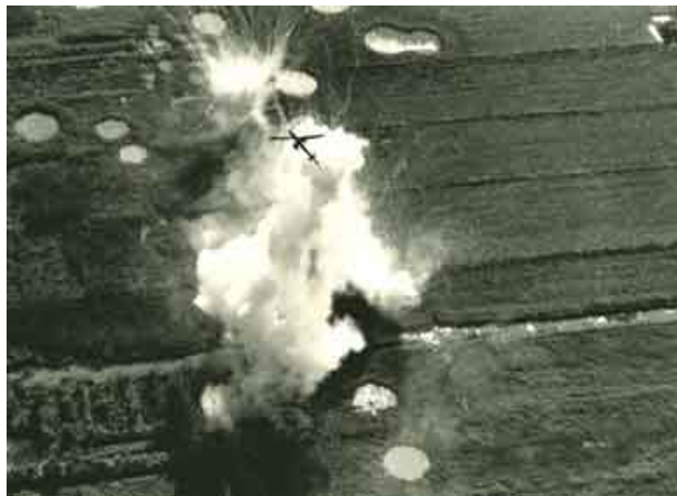
A helicopter gunship pulls out of an attack in the Mekong Delta during Speedy Express, January 1969.

By the mid-1960s, the Mekong Delta, with its verdant paddies and canal-side hamlets, was the rice bowl of South Vietnam and home to nearly 6 million Vietnamese. It was also one of the most important revolutionary strongholds during the Vietnam War. Despite its military significance, State Department officials were "deeply concerned" about introducing a large number of US troops into the densely populated area, fearing that it would be impossible to limit civilian carnage.