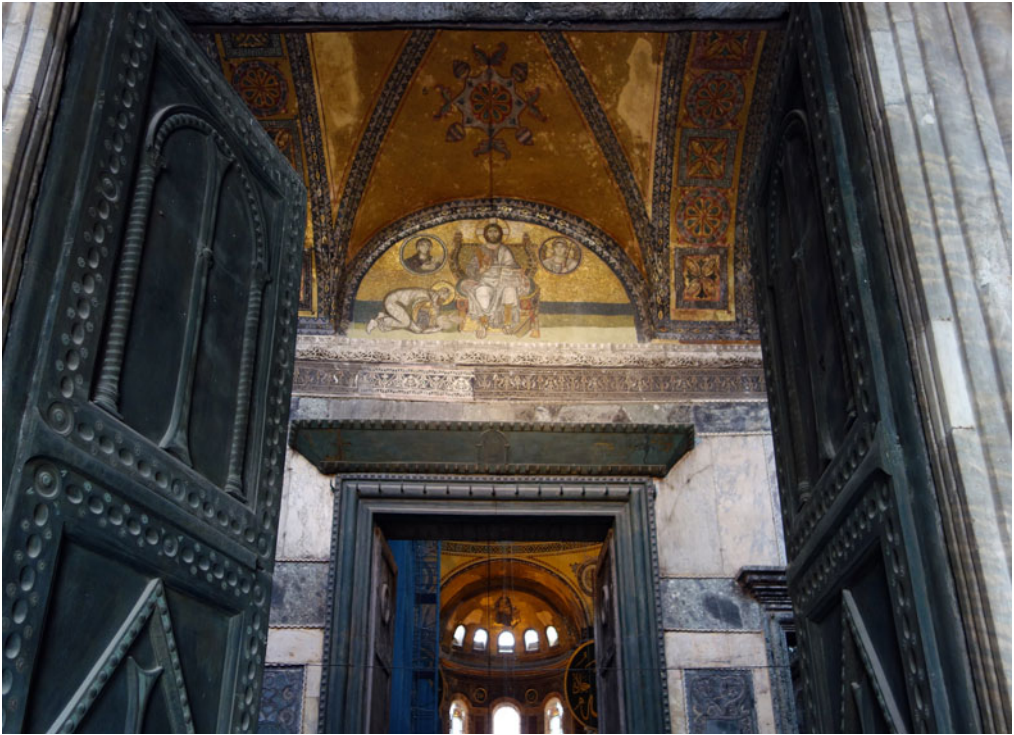
Figure 2 Hagia Sophia, Constantinople. A view of the royal proskynesis -mosaic

articulation of an eloquent visual comment on current public issues in the Byzantine capital.