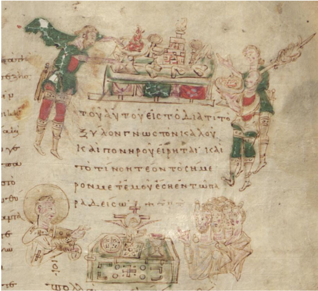
Figure 3 EBE 211, 56r. Two parallel banquets

Another indicative case of a royal model that stands out in stark contrast to the virtuous emperor will further underscore the talent of the miniaturist and his ability to adjust the imperial formula meaningfully within varied visual contexts. On folio 132v (Fig. 4) at the opening of the sermon dedicated to the moral value of repentance, 36 Herod and John the Baptist, the devious king is represented seated on a throne as he witnesses the abominable outcome of John's beheading. Directly across Herod the parchment has been excised, and, judging by the outline of the hole, we may safely assume that there it must have appeared the head of the Baptist on a disc. It might have been Salome presenting it to the king, or even Herodias herself. Herod embodies an anti-hero, the stereotype of the immoral and decadent