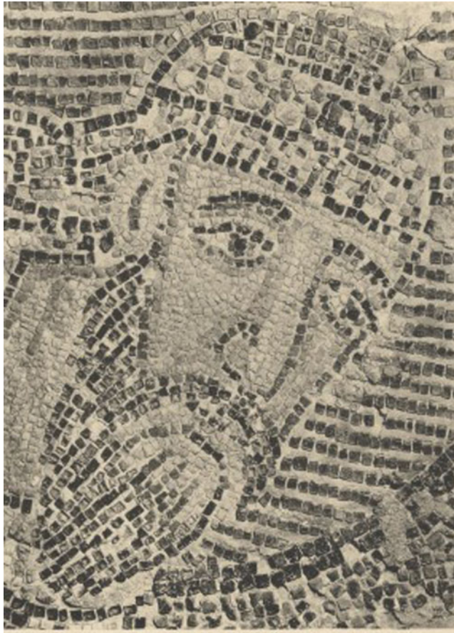
Figure 6 Detail of the emperor in the proskynesis -mosaic

aftertaste of mortality and an odour of death. Perhaps for this very reason, the laconic composition illustrating this sermon and mediating visually the entreaty of the king is meaningfully framed by the lofty cypress tree: it points elegantly upwards, towards the heavenly kingdom that both the ‘wise philosopher’ of the sermon and the kneeling emperor of the image anticipate vehemently.