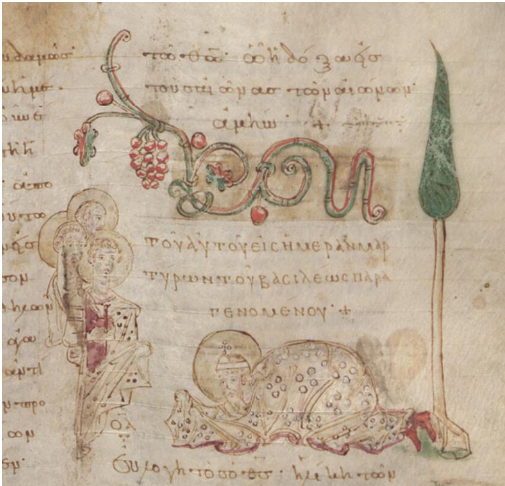
Figure 1 EBE 211, fol. 63r. An anonymous emperor prostrating at the feet of three anonymous martyrs (by the permission of the National Library in Athens)

end of Iconoclasm in varied ritual and devotional performances, is no easy task. Gestures and postures mattered, and their charged choreography did not necessarily assign a single meaning to a particular move. So, context is pivotal in the process of unravelling the transformation of the elusive posture of proskynesis from the pragmatic into the symbolic.