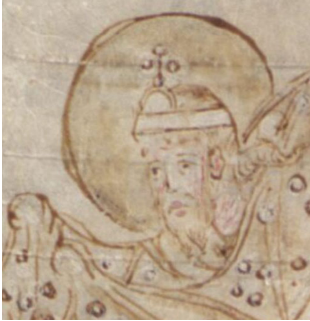
Figure 5 Detail of the imperial figure in EBE 211, fol. 63r

Drypia, which was delivered in the presence of the empress and sounded more like a panegyric, 38 the second one contained in the Athenian codex is rather introverted and loaded with soteriological overtones. Right from the beginning the emperor and his military escort are praised for their humility. By escaping the vainglory of worldly power, pride and ostentation, they will reap their reward in heaven through the intercession of the martyrs. Death, unknown to God's creatures before the fall, was taught to Adam and Eve by the Creator Himself through the fratricide. The heroes of the Old Testament such as Enoch, Noah, Jonah, and Elijah, prefigured through their example salvation from death and thus offer comfort and hope to the believer. The sermon ends with an interesting address to the 'philosopher and the sublime one', 39 for whom the hierarch's admonitions are unnecessary, since he already knows the magnitude of the heavenly kingdom and realizes the vanity of earthly pleasures and temptations. 40 Undoubtedly, the spirit of the homily leaves an