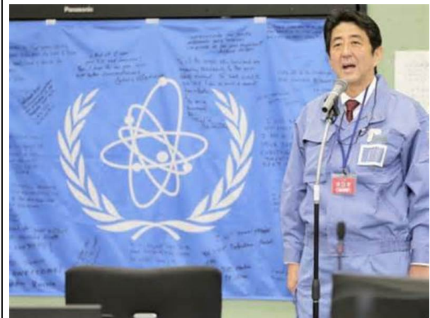
PM Abe talking to Tepco employees

from over and that entrusting the clean-up to the plant operator was a colossal mistake because it left critical decisions up to the industry insiders who compromised nuclear safety before 3.11 and subsequently mismanaged the crisis. Why, despite a cascade of media exposés about the water problem, did the government wait so long to intervene? And, why did intervention suddenly become so urgent?