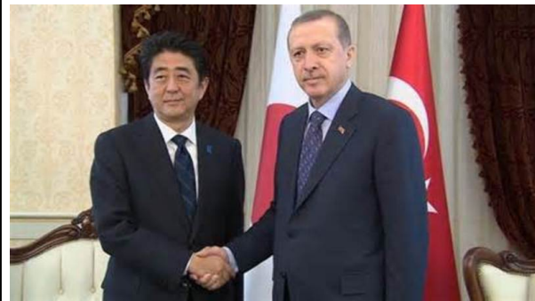
PM Abe Clinches $22 bn Nuclear Deal with Turkish PM Erdogan

exports of nuclear power plants. Toshiba owns 87% of Westinghouse while Hitachi and Mitsubishi have tie-ups with GE and Areva meaning that Japanese firms are major players in nuclear energy. Abe has become an active pitchman for Japanese nuclear technology, but if Japan begins phasing out its nuclear reactors, potential clients might look elsewhere. Abe's growth strategy calls for tripling infrastructure-oriented exports to $300 bn by 2020, and nuclear technology exports are key to achieving this target. Earlier this year Japan (with French companies) secured a long-term $22 billion contract with Turkey (a quake prone country). It has also signed a nuclear technology agreement with the United Arab Emirates and is eyeing sales to Brazil and Saudi Arabia. Negotiations are also ongoing with India to enable Japan to sell its technology there and Abe lobbied hard on behalf of Japan's nuclear exporters at a June 2013 central European summit of the Visegrad countries (the Czech Republic, Hungary, Poland and Slovakia) He also signed an agreement with France in June 2013 to deepen cooperation on nuclear exports. (The Diplomat 7/3/2013)