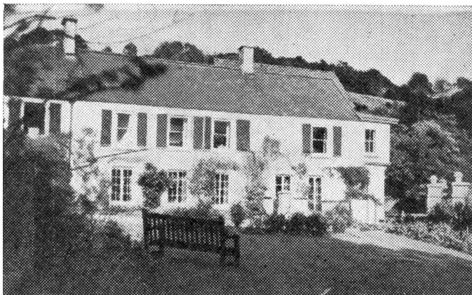
CRICKLEY COURT—ONE OF THE SEPARATE VILLAS

A REGISTERED HOSPITAL for the CARE and TREATMENT of LADIES and GENTLEMEN suffering from NERVOUS and MENTAL DISORDERS. Within two miles of the Western and London Midland Regional Railway Stations at Gloucester, the Hospital is easily accessible by rail from London and all parts of the United Kingdom. It is beautifully situated at the foot of the Cotswold Hills, and stands in its own grounds of over 300 acres. Voluntary Patients of both sexes are also received for treatment. Special accommodation is also provided at three villa residences, all of which stand in their own grounds and are entirely separate from the main Hospital. All the most modern methods of treatment including electric shock and prefrontal leucotomy are used.