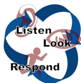
Figure 2. Rapid Response Process of the Research-to-Policy Collaboration.

discipline, the burden of the research translation is shared among colleagues within a field. Since the diversity of voices represented in the RRN affect the message received by policymakers, it is critical that the RRN is populated by scholars who range in expertise in the discipline. This component of the model is critical for rapidly responding to policymakers' goals and interests, and thus its ability to be timely, responsive, and precise is contingent on the makeup of a scholarly discipline that is at the ready for research translation and impact.