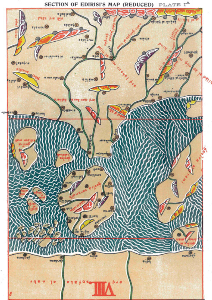
NOTE:- The map is inverted to enable SERENDIB (Ceylon) to be located easily, in the actual map the South was taken as the top of the map.