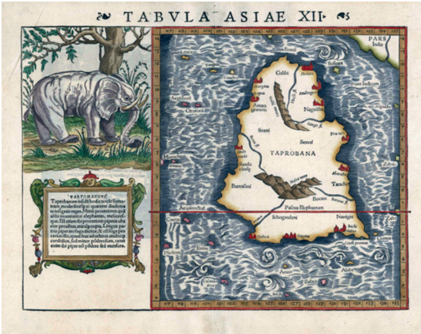
Figure 5.2 Tabula Asiae XII ; hand-coloured map by Sebastian Münster, c.1552. From Ptolemy's Geographia universalis , 1540 ed., rev. & ed. by Sebastian Münster. Sri Lanka is labelled 'Taprobana' on the map, a name which was given to Sumatra on maps in later editions of the Geographia . MIT.

elephant's angry eyes and serpentine trunk immediately attract the reader's attention. The way in which this elephant is depicted is in keeping with earlier European mapping traditions which sometimes represent elephants as looking like wild boars with trumpet-like trunks. 21 Ludovico di Varthema, who visited Lanka, is then cited. The island, we are told, 'exports elephants that are larger and nobler than those found elsewhere'. 22 Taprobane becomes known here for its anomalous natural history; its unusual elephants make a stand on the map. The description from Varthema continues: 'Its yield of the long pepper is likewise richer, indeed wonderful in its abundance.' 23 Soon the map was edited once again, and the elephant was made less fierce (Figure 5.3). Even while tracing the reverberations of Ptolemy's 'Taprobane' like this, one important caveat is that the idea, together with the knowledge of sailors and merchants