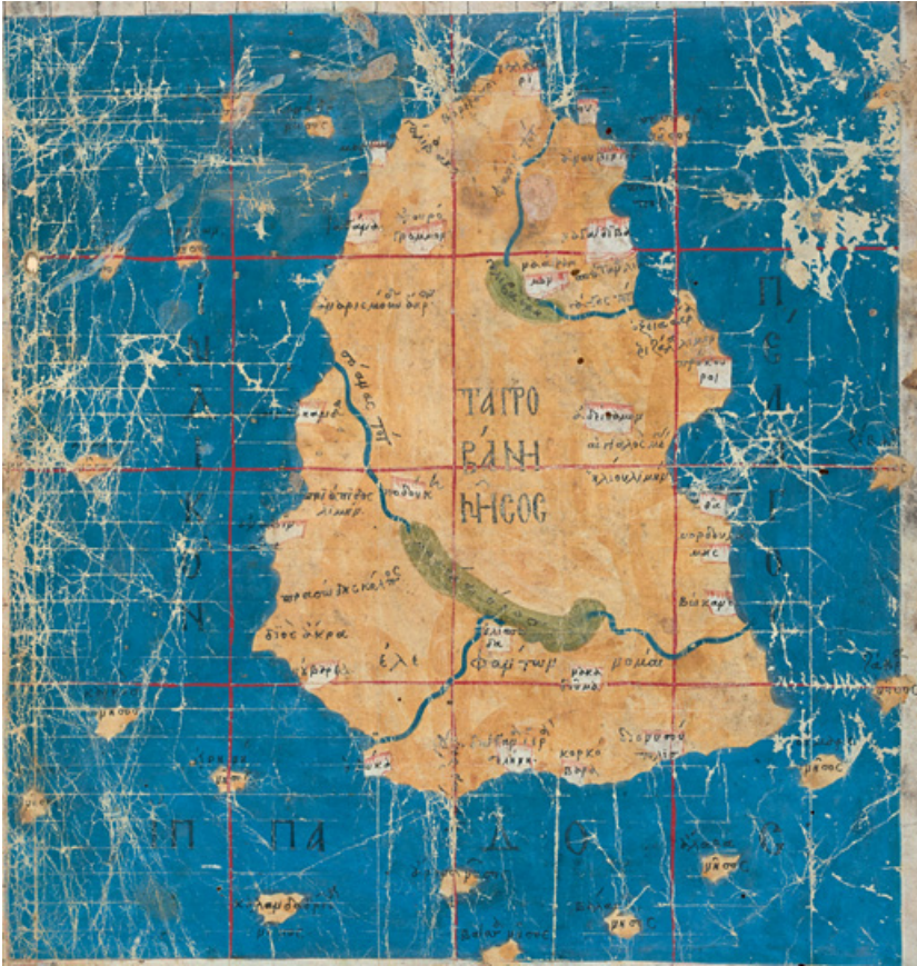
Figure 5.1 Map labelled ‘Taprobana insula’, with the lowest horizontal line representing the equator. British Library, Burney 111 f1v. British Library.

Taprobane, including this map, were utilised on the island to tell stories of the resizing of Sri Lanka by repeated tidal waves, as part of the gods’ judgement for bad government today.