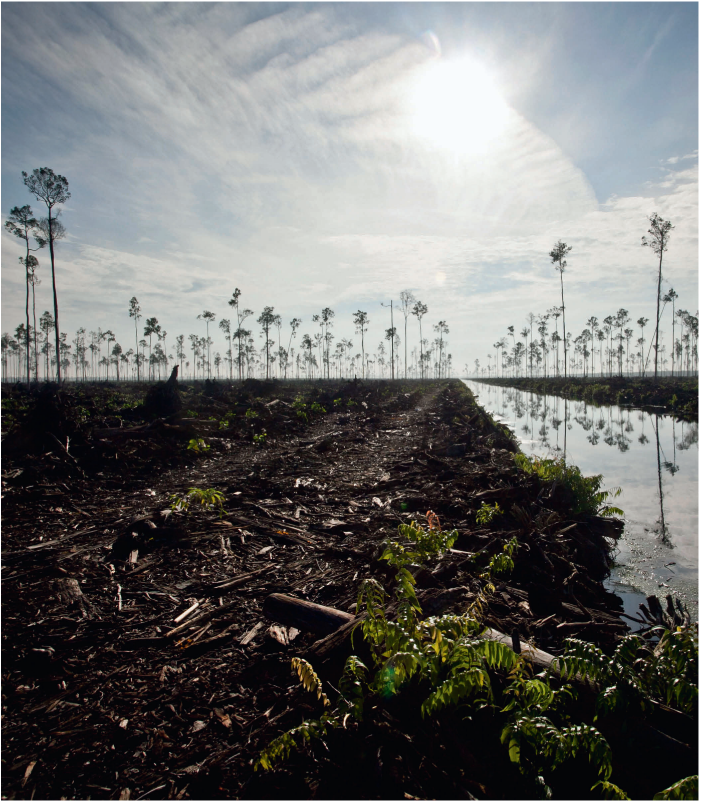
Photo: The overriding threat to the survival of apes is habitat loss. Forest destruction on Sumatra, Indonesia.