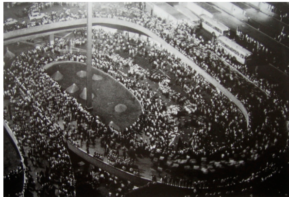
Shinjuku Underground Plaza, July, 1969.

to protest the entry of a US nuclear submarine into the port at Yokosuka, only a few hundred students showed up.