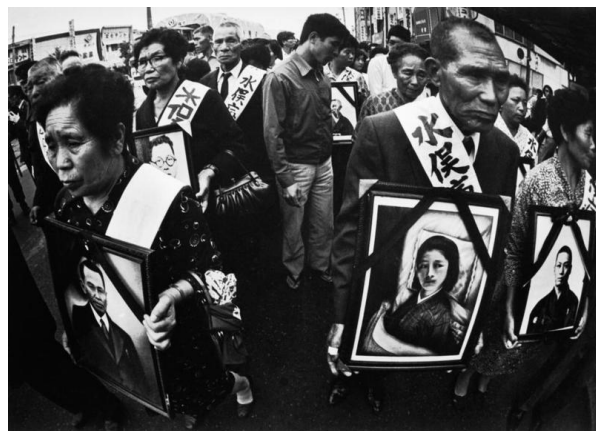
W. Eugene Smith, Minamata Bay, 1971.

Around 1968, people in Japan began to pay attention to environmental concerns and minority issues, as well as to the women's liberation movement. The connections among these developments and the student uprisings warrant deeper investigation.