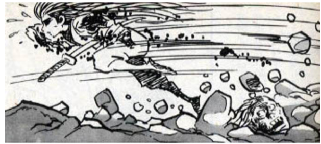
Tomorrow's Joe Star of the Giants Ninja Combat Manual