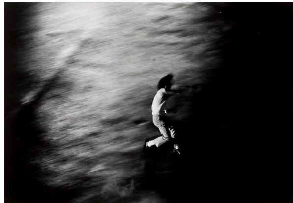
Tōmatsu Shōmei, Untitled from the Protest Series , 1969.