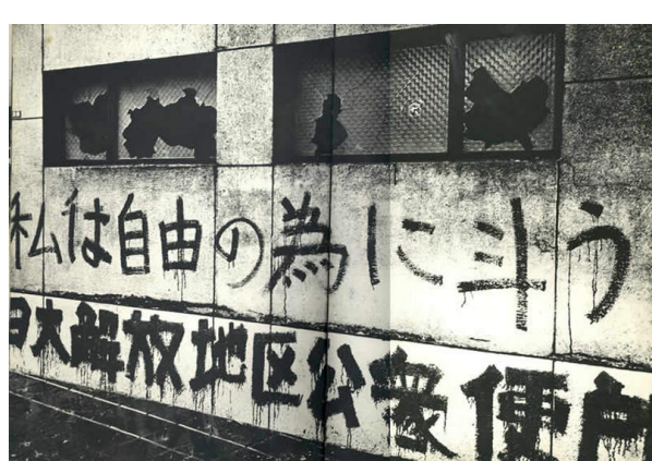
Graffiti at Nihon University, "I fight for freedom"; "Nihon University Liberated Zone Public Toilet."

The strategy of barricading and occupying universities relied on a longstanding image of universities being at a monastic remove from the everyday world-autonomous zones where the police and other external forces should not intervene. Fearing a backlash from the public and the university professoriat, police initially refrained from entering the barricaded campuses, and the student occupations of Tokyo and Nihon Universities lasted more than six months.