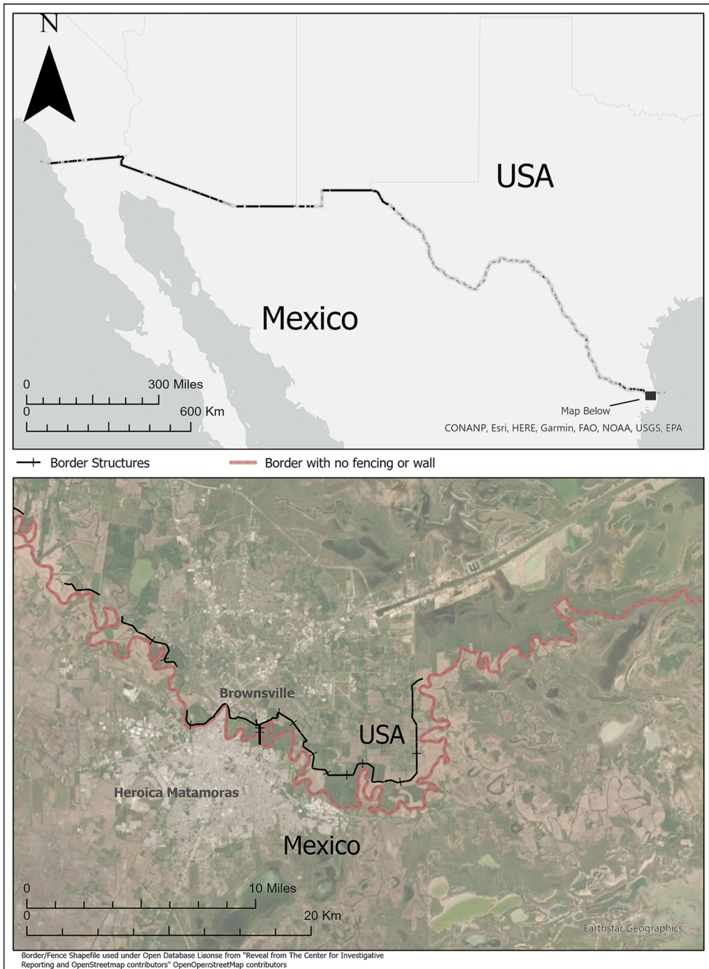
Figure 3. Maps of the US/Mexico border (figure by B. Buchanan).