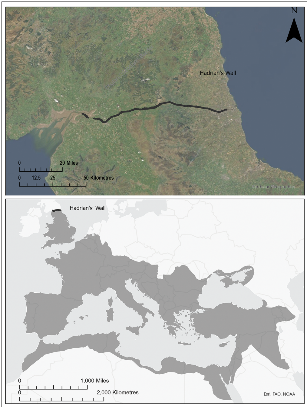
Figure 2. Maps of Hadrian's Wall and the Roman Empire (figure by B. Buchanan).

note that “the broader task of public archaeologies of frontiers and borderlands is an as-yet largely unexplored field”, and one that must be developed. This is particularly pressing in the context of the development and reliance on hard boundaries—often demarcated by