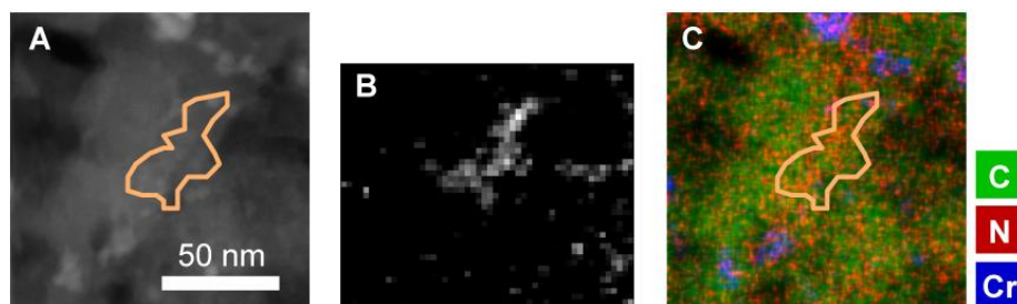
Figure 2. (A) STEM-MAADF image of an invisible cluster of nanodiamonds in Murchison IOM. (B) Corresponding diamond map. (C) Corresponding EDS map indicating a ~40% enrichment in N.