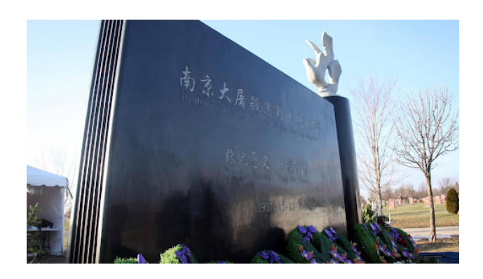
Image 2. Nanjing Massacre Victims Monument at Elgin Mills Cemetery in Richmond Hill, Ontario during its 2018 unveiling.

"anti-racism; education; heritage; monument; community and culture; and especially seniors' health and wellness" (BC Redress 2022b).