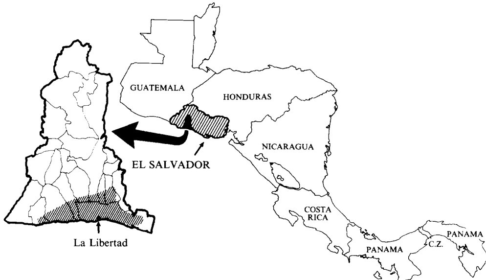
Fig. 1. Map of El Salvador with La Libertad Department indicated and the site of the investigation highlighted.

The first case of epidemic cholera in El Salvador was diagnosed on 16 August 1991. By 27 November 1991, 709 cases had been reported [1]. The epidemic affected a number of villages in La Libertad Department. We conducted a case control study in La Libertad in November 1991 to evaluate risk factors for cholera transmission.