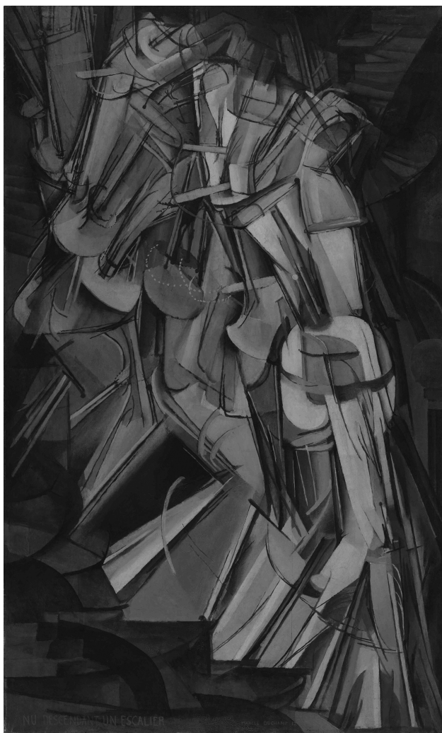
5.1 Time in space: Duchamp, "Nude Descending a Staircase, No. 2." © 2016 Succession Marcel Duchamp/ADAGP, Paris/Artists Rights Society (ARS), New York.

noting that Duchamp's paintings of the period "add a new X-ray-related element to [his] continued exploration of transparency and cutting: stripping and nudity." 11 His Armory Show painting used its technological inspiration to unite the tensions of internal and external worlds, time and space, into a single aesthetic perception.