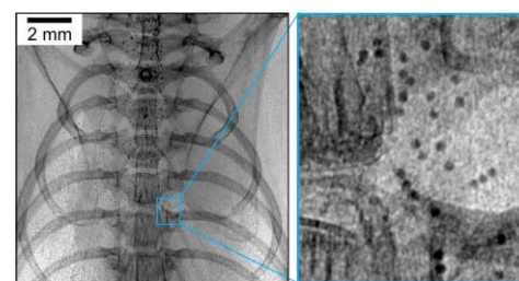
Figure 2. Mucociliary clearance can be observed by tracking small debris in the airways, shown here using 75 \mu\text{m} beads.