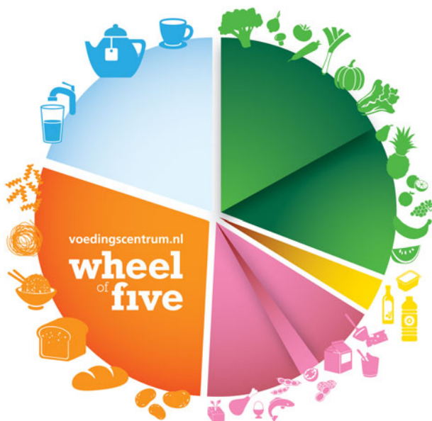
Fig. 2 Wheel of Five: graphical representation of the food-based dietary guidelines for the Netherlands