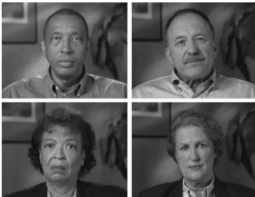
Figure 1 Virtual patients (all photographs are of actors who have given their permission for them to be used)

the context of a routine primary care office visit. Over a period of six months, individual interviews were conducted with primary care patients who had suffered depression and a myocardial infarction separately and concomitantly. Focus groups and interviews were also conducted with physicians to ensure the representativeness of the virtual dialogue on which the CD-ROM vignettes were based. Additionally, audiotaped conversations from actual physician–patient encounters were used to create preliminary scripts (Cooper et al. , 2003). Scripts were reviewed and edited by a panel comprising internationally recognized experts from survey and primary care research, psychiatry, cardiology, and mental health.