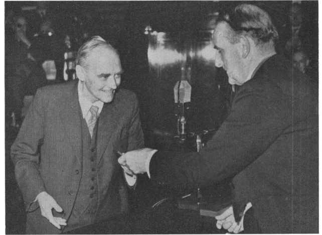
Sir GEOFFREY TAYLOR, F.R.S., Hon.F.R.Ae.S., receiving the Gold Medal of the Society from the President, Sir SYDNEY CAMM, C.B.E., F.R.Ae.S.