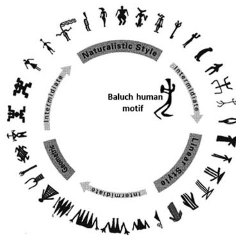
Figure 4. Diagram of human motifs and the position of the Baluch motifs within it (Garfinkel 2003a: fig. 8.8).

scenes from Çatalhöyük (Mellaart 1963: pls XLV & LIV) (Figure 6a) and the human motifs of Tepe Gawra (Tobler 1950: pl. LXXVab) (Figure 6b), Sakje Gozu (Garstang et al. 1937: pl. XXV-15) (Figure 6c) and Sabi Abyad (Akkerman 1967: figs 21–40) (Figure 6d).