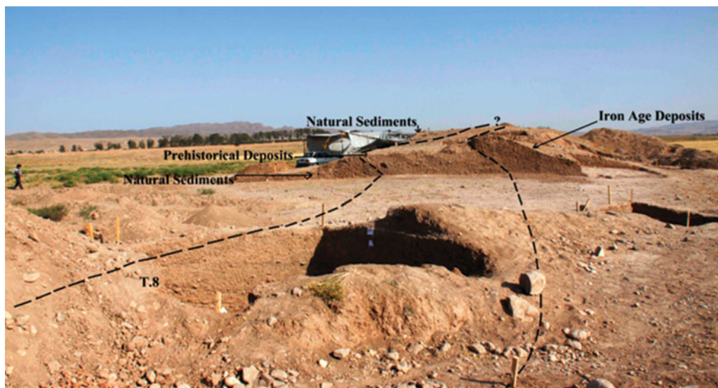
Figure 2. View of excavations at Tepe Baluch (Garazhian 2013: fig. 5).