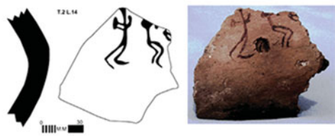
Figure 3. Human motifs on pottery sherd from Tepe Baluch (Garazhian 2013: fig. 18).