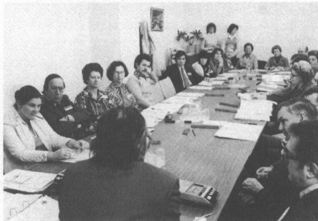
Inaugural meeting of the IYC National Committee of Non-Government Organisations, held in Sydney on June 12.