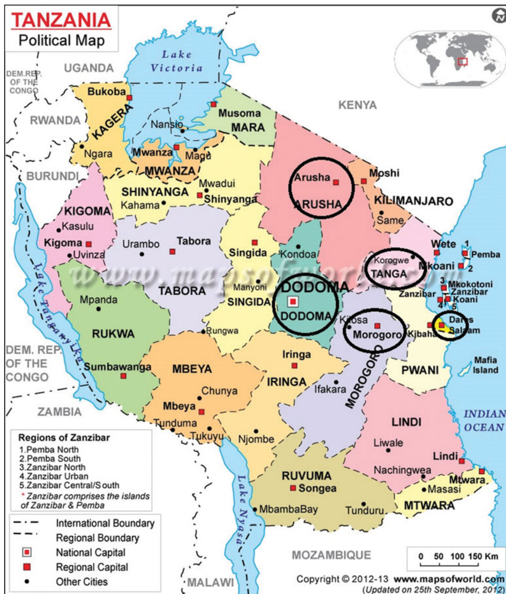
Figure 1. Map of Tanzania showing study regions.

surrounding towns experience generally tropical climatic conditions, typified by hot and humid weather throughout much of the year. Annual rainfall is approximately 750–1100 mm, and in a normal year there are two rainy seasons: the major rainy season is in April and May, while the minor season is usually from October to November. This region is characterized by infertile sands on gently rolling uplands and fertile clays on uplands and river floodplains.