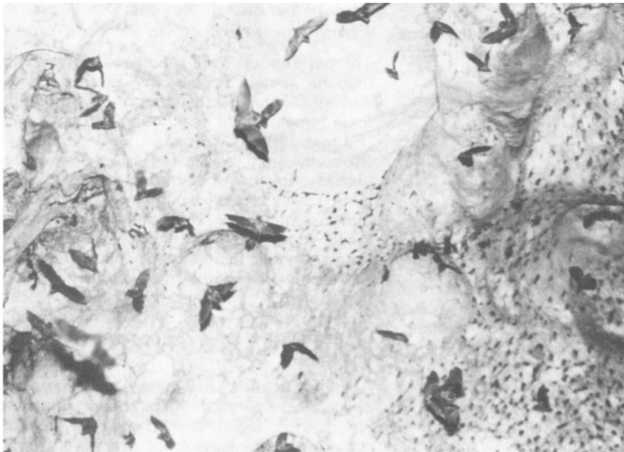
Bats in the roof of Oxford Cave, Jamaica (Donald A. McFarlane).

on pollen and nectar feeding, so that it is likely that the species would exhibit a dietary shift from pollen and nectivory in the dry season to frugivory in the wet season. Goodwin (1970) reports a female with embryo taken in late January, but nothing else is known of the species's reproductive habits.