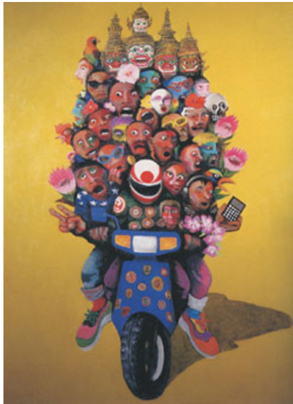
"Let's go to Japan" (1991), an oil by Taeko Tomiyama (trimmed). COURTESY OF THE ARTIST

Funnily enough, though, those kinds of people don't bother much about works of literature, because it takes time to read them carefully. But they can see paintings in a moment, so they can more easily target the fine arts.