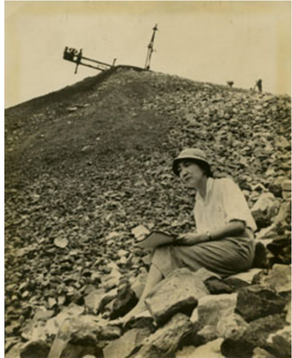
Field studies: Taeko Tomiyama sketches on a spoil heap at a coalmine in the Kyushu city of Chikuho, Fukuoka Prefecture, in the mid-1950s. Her visit there and to other mines around Japan moved her to produce a series of writings and stark images depicting the harsh conditions that workers in the mining industry were made to endure. Those experiences were also a turning point in her life, as she afterward fixed her creative focus firmly on social

Well, if you asked them, most would probably say, "I like to paint pictures." (laughs) But of course nobody asks artists here why they are doing what they do. Teachers never think about it, so they don't ask their students.