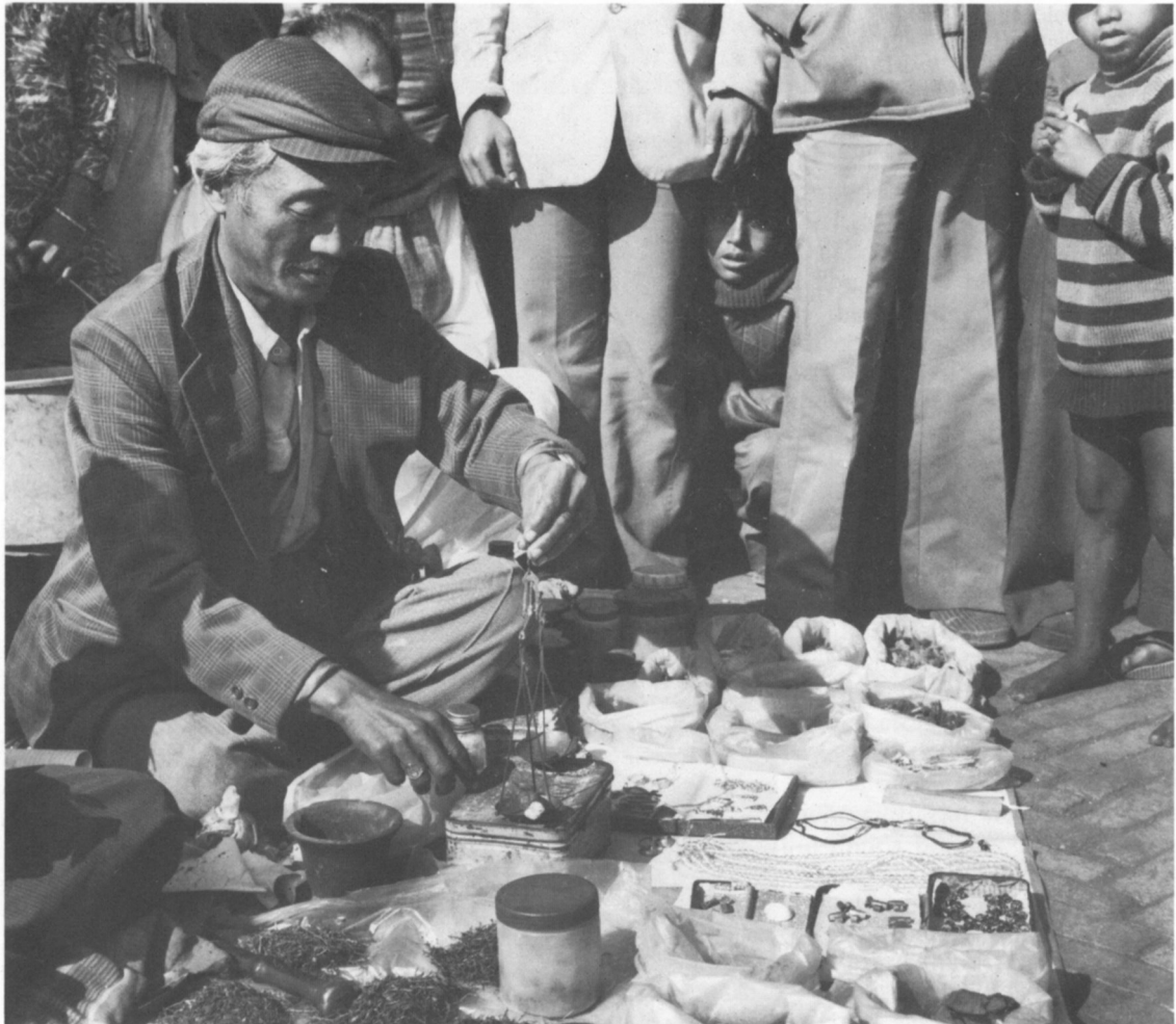
A pedlar of traditional Nepalese medicines in Kathmandu weighs a small piece of rhino umbilical cord.

family and several Hindu priests, were mounted on elephants and led by the Park's people, also on elephants, to a large male rhino outside the Park's northern boundary. Altogether 26 elephants were used to encircle the rhino to prevent its escape and to allow the King to shoot it at close range. On the following morning, the fallen beast was dragged to the Rhapti river near Kasara, where a group of men disembowelled it. The King, dressed in a simple white robe, entered the abdominal cavity, knelt down and filled his cupped hands with rhino blood, which he offered to his gods in memory of the late King Mahendra, his father. Hindu priests chanted prayers throughout the ceremony of the rhino sacrifice.