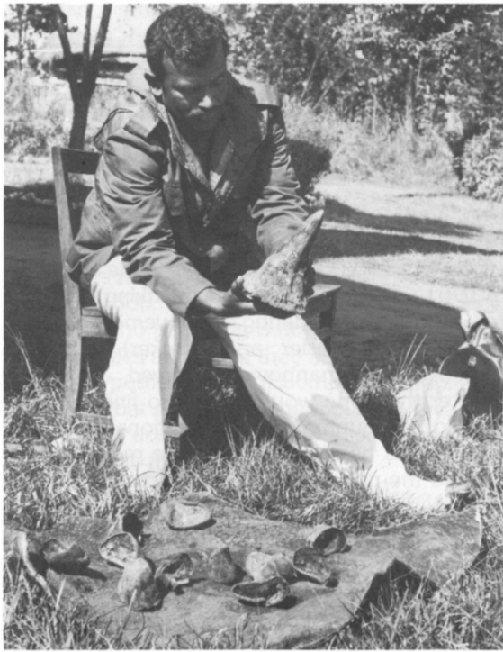
The Warden of the Royal Chitawan National Park examines the horn, hooves and hide of a rhino that had recently died of natural causes in the Park (Esmond Bradley Martin).

While rhino-hide shields were probably not made in India after the turn of the century, three families in Patan, including the Silpakars, continued to produce them until around 1945. They paid $8 in 1940 for a piece of hide sufficient to make one shield. To render it pliable, they soaked the raw hide in water for several days then placed it between blocks of wood to dry it in the exact shape wanted. Afterwards, they trimmed the edges, sand-papered and polished the shield, sometimes adding charcoal for a black finish. Metal bosses for the inside handles were purchased from blacksmiths and attached to the