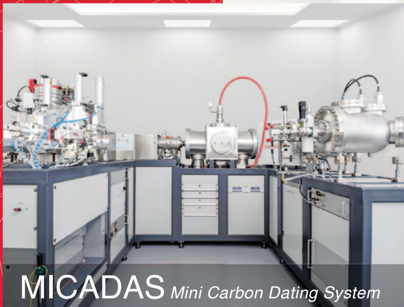
MICADAS Mini Carbon Dating System

Scientific Instruments for Radiocarbon Dating and Accelerator Mass Spectrometry