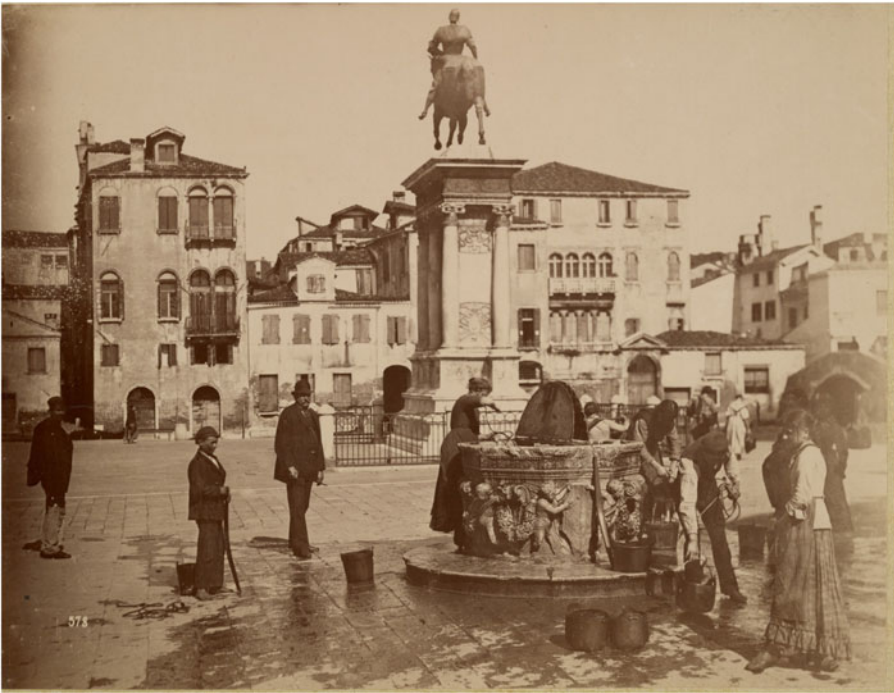
Figure 3. Public well (cistern), Venice about 1870–1880.