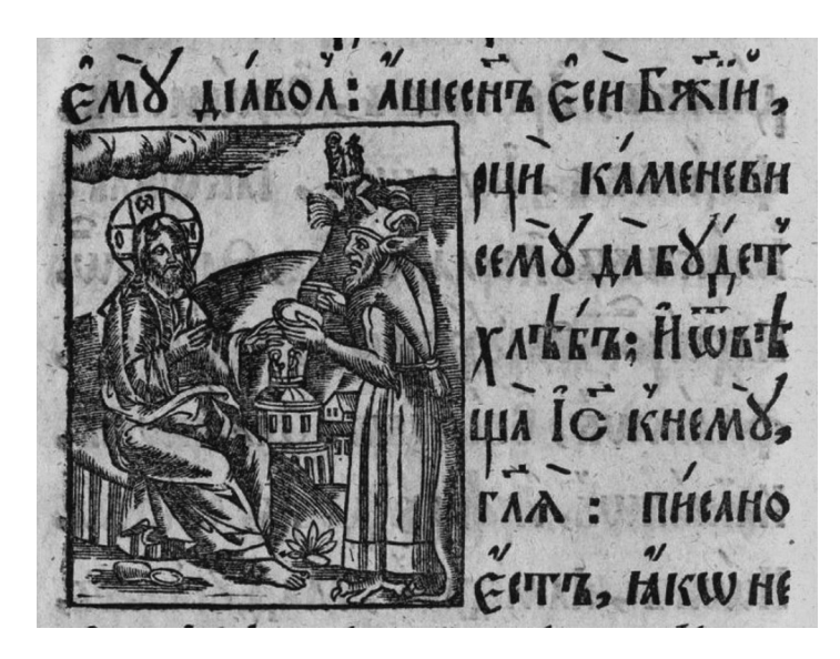
Figure 5. Evanhelie (Lviv, 1636). The devil tempting Christ in the desert.

issue of discernment among Ukrainian Orthodox intellectuals that a booklet about his fight against demonic temptation, A wonderful story about the devil, as he came disguised as a man to Anthony the Great, asking for penance, was also printed in Kyiv in 1626 by the Caves printing press.<sup>68</sup>