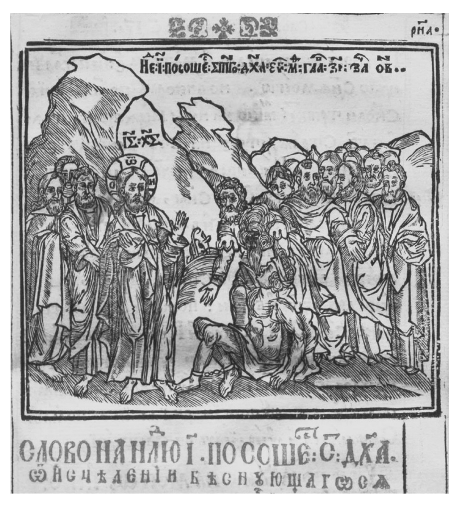
Figure 1. Lazar Baranovych, Mech dukhovnyi (Kyiv, 1666), engraving preceding the sermon on the exorcism of the lunatic boy (Matthew 17:14–21). The same engraving had previously appeared in the Evanhelie uchytelnoe (Kyiv, 1637).

strengthen their authority by allying with a foreign power—Muscovite Russia, the Polish Crown, or the Ottoman empire.<sup>10</sup>