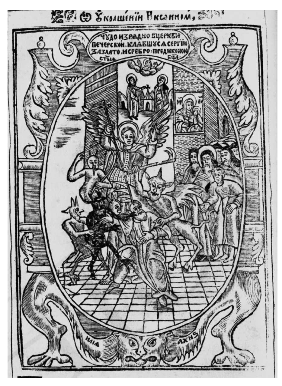
Figure 4. Paterik, ili otechnyk pecherskii (Kyiv, 1661). Image prefacing the story of the miracle concerning Ioann and Sergii.

bid this pitiless angel to destroy me! Pray to the holy Theotokos that she will drive away the many demons to which I am delivered!"<sup>61</sup> Paralleling the collection's emphasis on the monks' "real" encounters with demons, these