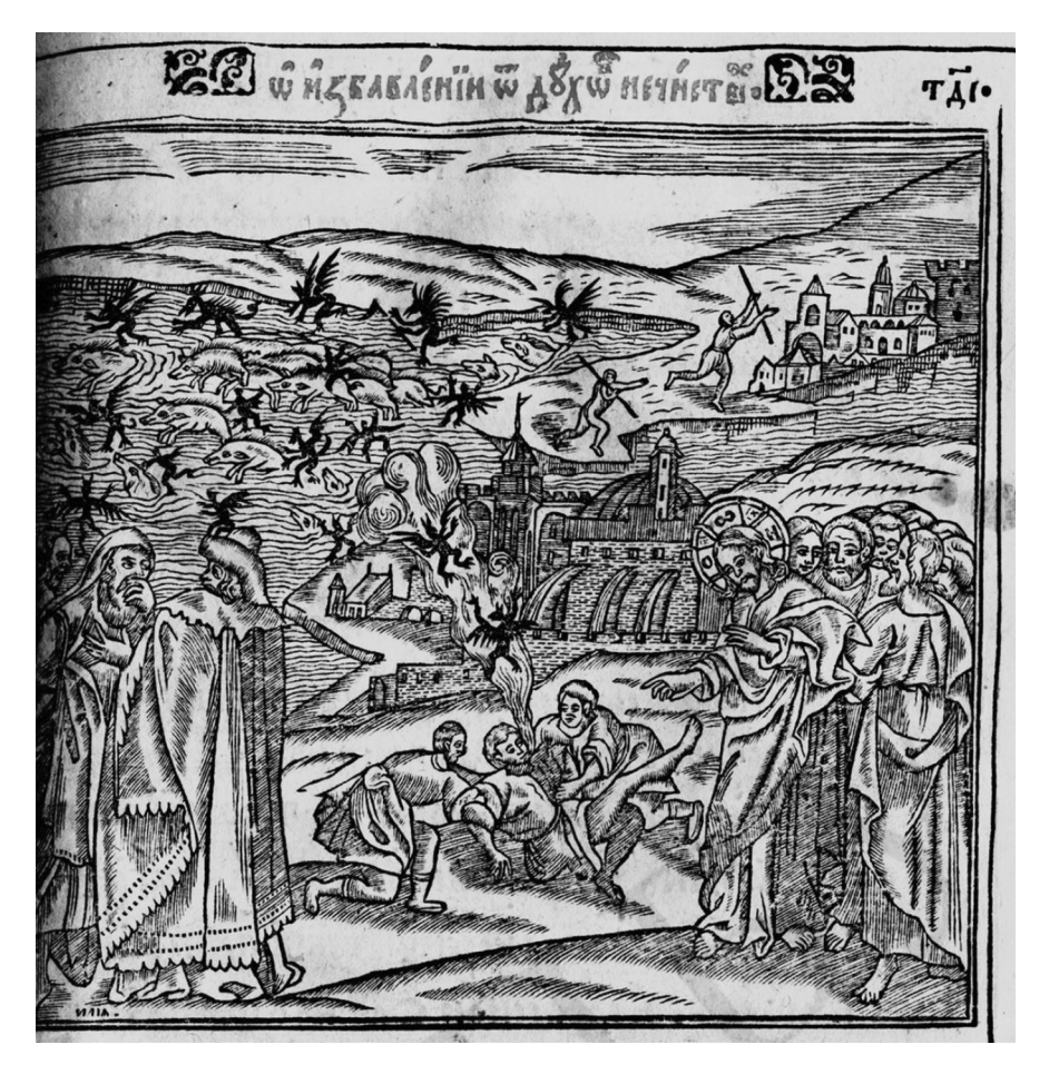
Figure 3. Eukhologion, albo Molytvoslov, ili Trebnyk (Kyiv, 1646). Christ exorcizing the Gerasene demoniac. Engraving by Master Illia preceding the rite of exorcism.

it is not coincidental that his Trebnyk (1646) contains a long section on the exorcistic rite illustrated by a dramatic engraving of Christ casting out a multitude of demons from the Gerasene demoniac, an episode that functions as the biblical prototype of priestly exorcism (Figure 3).<sup>49</sup> Frequent representations of Jesus exorcizing the demoniacs in the books printed in Kyiv in the second half of the century possibly suggest a similar effort to demonstrate the authority of the clergy in the battle against diabolic disorder (Figure 1).