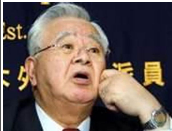
Keidanren Chairman Yonekura Hiromasa

and with "constant verification and revision" — hedges that might keep the nuclear industry in business indefinitely." (Financial Times 10/24/2012) The Cabinet caved on its pledge to phase out nuclear energy just one day after the nation's three largest business groups Keidanren (Japan Business Federation), Keizai Doyukai (Japan Association of Corporate Executives) and the Japan Chamber of Commerce and Industry issued a joint statement complaining that the government had ignored their objections to a nuclear phase-out. Keidanren Chairman Yonekura Hiromasa inveighed, "We object to the abolition of nuclear power from the standpoint of protecting jobs and people's livelihoods. It is highly regrettable that our argument was comprehensively dismissed." (Asahi 9/19/2012) Publically admonished by the nuclear village elders, the Cabinet promptly flip-flopped.