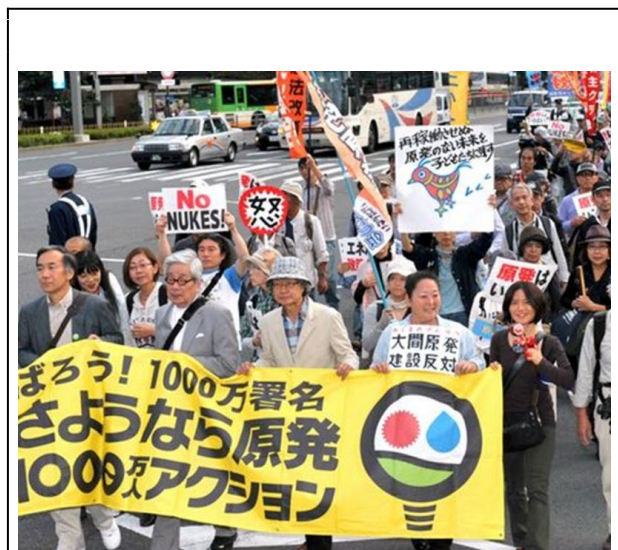
Nobel laureate Oe Kenzaburo (2 nd front left) leads anti-nuclear demonstration in Tokyo on October 13, 2012, the day after TEPCO's admission of guilt

investigations assert that the meltdowns were preventable and refuted Tokyo Electric Power Company's (TEPCO) claim that the massive tsunami was an inconceivable black swan event that caused the three meltdowns and hydrogen explosions. Finally, on October 12, 2012 TEPCO abandoned its tsunami defense and acknowledged that the nuclear accident was caused by its excessively optimistic risk assessments, shortchanging of safety and training, and failure to adopt appropriate countermeasures.