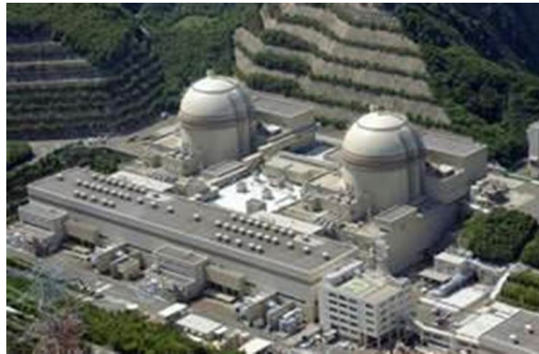
The Oi reactors may be sited on an active fault-line