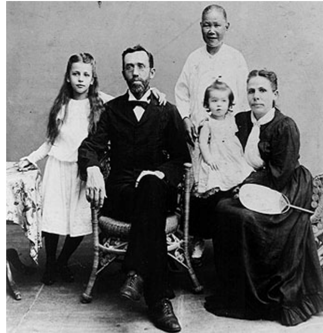
Buck at home in Zhenxiang as a child

Earlier this fall, local authorities in Zhenjiang, a city on the Yangzi known for its vinegar, opened a Pearl Buck Museum in the house where Buck (1892-1973) spent most of her first eighteen years. The ashes of another historic figure, Edgar Snow (1905-1971), are divided between the Hudson River and a spot by the Nameless Lake on the campus of Beijing University, which had been the campus of Yenching University. Leighton Stuart was president when Snow taught there in the 1930s.