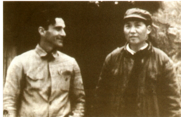
Snow and Mao Zedong in 1936

Edgar Snow and Pearl Buck did not fare much better. Snow moved to Switzerland and continued to write about China, returning to China in 1960 and then for the last time in 1970. Buck was suspect because of her racial liberalism and anti-imperialism but generally moved on to less provocative (and more lucrative) topics. With the Korean War in mind, she wrote in her 1954 memoir, My Several Worlds : "Over and over again in recent years Americans have said to me with real sadness that they cannot understand why the Chinese hate us 'when we have done so much for them.' Actually, of course, we have done nothing for them. They did not ask us to send missionaries nor did they seek our trade." [7]