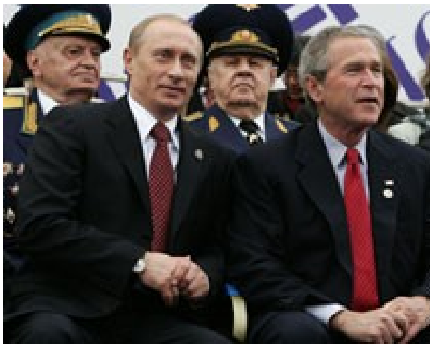
Putin and Bush in Moscow in May 2005

Last May, Moscow hosted an international gathering to commemorate the 60th anniversary of the end of the Second World War (Germany surrendered in May 1945). The ceremonies were attended by the leaders of the nations that comprised the Second World War Allies, including U.S. President George Bush and almost all the other heads of the G8 nations, as well as Chinese President Hu Jintao. This gathering on the 60th anniversary of the end of World War II also illustrated to the world that former mortal enemies Russia and Germany had achieved a historic reconciliation and a close strategic partnership. And this ceremony of reconciliation between Russia and Germany, based on the emergence of multipolarity, was actually carried out with Bush as a participant .