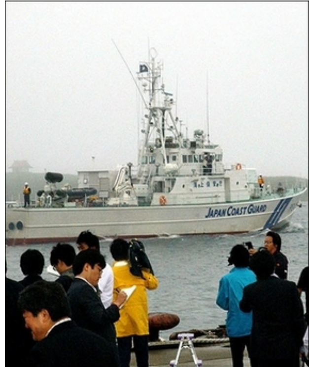
A Japan Coast Guard ship leaves for the disputed area in August 2006.

In August 2006, Japan-Russia relations were strained when a Russian patrol fired warning shots at a Japanese fishing boat, killing a member of the crew. The boat was near disputed islands—what the Japanese call the Northern Territories and the Russians call the Southern Kuriles. The incident occurred in the 50th anniversary year of the Japan-Soviet Joint Declaration (signed on October 19, 1956, and in effect from December 12 of that year). It was a powerful reminder of a lingering territorial problem, which has been the major obstacle preventing the two countries from signing a post-World War II peace treaty, as well as a continuing source of conflict.