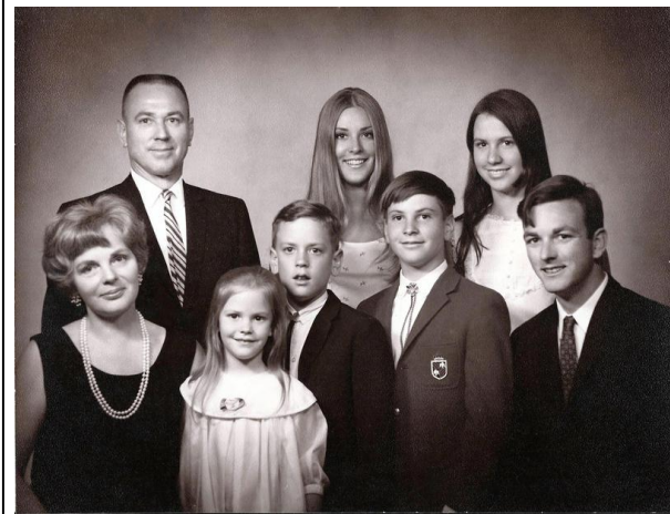
Bird family portrait 1967. The author is top center.