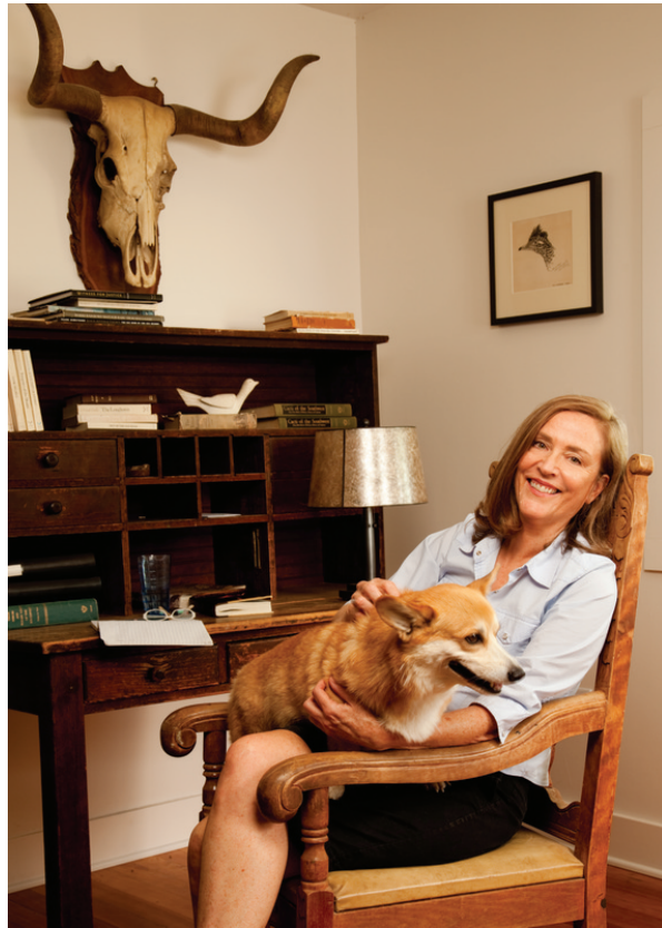
Sarah Bird at the University of Texas writer residence.