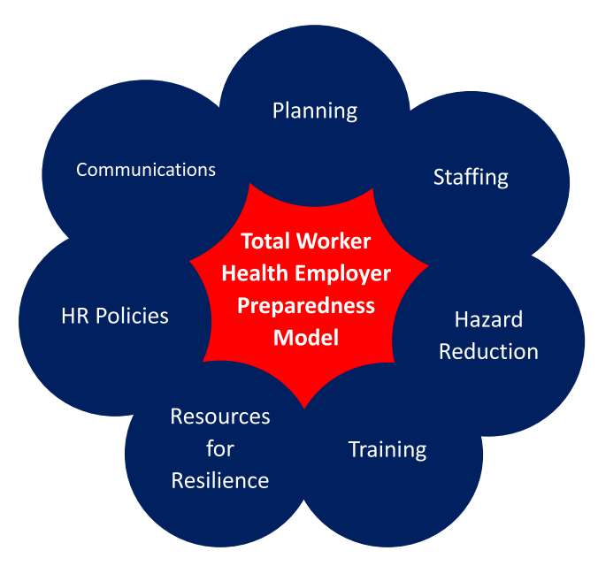
Figure 2. Domains of the TWH Employer Preparedness Model.

to Planning Equity focuses planning efforts on the needs of employees who are disabled, older, temporary/contract, and others who may need special attention, such as employees with limited English-language skills.