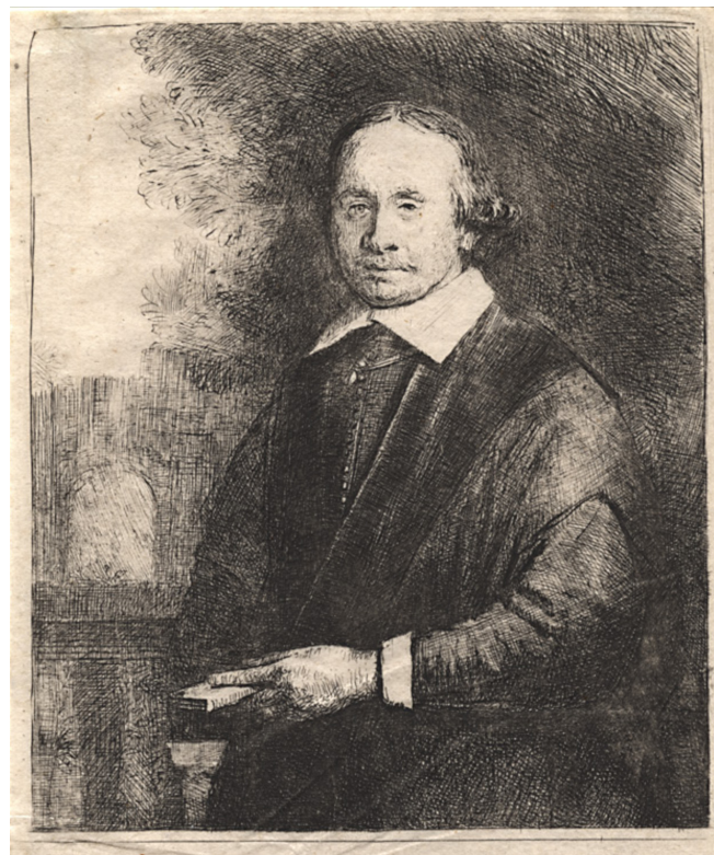
Figure 2. An impression (etching) by Rembrandt of the physician Jan Antonides van der Linden.