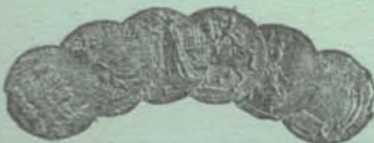
Gold Medal Allahabad 1910.

Paris 1900, Brussels 1910, Buenos Aires 1910.