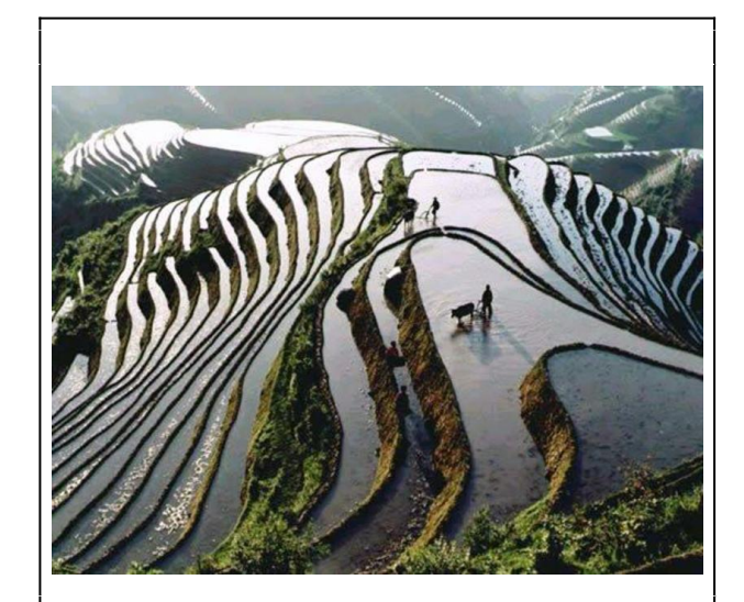
Terraced rice fields

producer of greenhouse gases in 2012, continues to set energy prices, and to ensure that energy produced from coal powered plants remains cheap. Chinese industry thus remains dependent on an energy source that not only holds a dominant position, but continues to grow and to spew vast amounts of pollutants and global warming gases into the atmosphere. It's almost as if there are two Chinas—one on the leading edge of developing energy from clean and renewable sources, and the other recklessly polluting land, air, and water in a break-neck race to industrialize as rapidly as possible, and maybe, after that task is accomplished, to clean up their environment. In response to Western environmental critics of these rapidly expanding emissions, Chinese officials have asserted that this was precisely the Western approach. But even that pattern is not so clear as the pressures for continued economic development in the world's richest economies continues to drive our unsustainable dependence on fossil fuels.