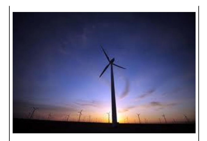
Wind turbines in Gansu

This is the other side of China's development. Although it is the world's biggest CO2 emitter and notorious for building the equivalent of a 400 megawatt (MW) coal-fired power station every three days, it is also erecting 36 wind turbines a day and building a robust new electricity grid to send this power thousands of kilometres across the country from the deserts of the west to the cities of the east.