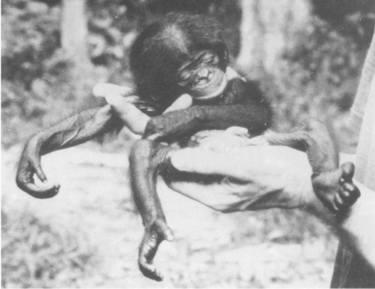
One of the captured baby pygmy chimps.