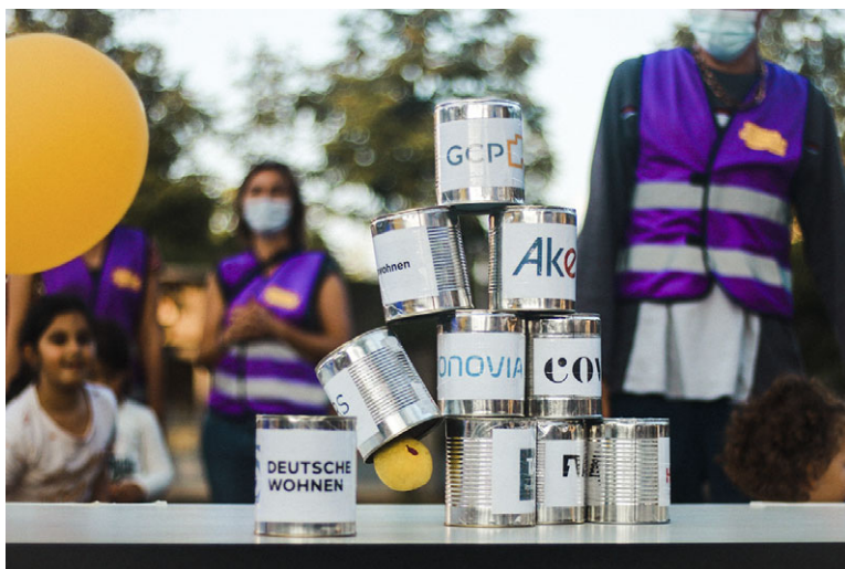
Figure 3.3 Election evening games: Will it be possible to overthrow the rule of corporate landlords?

The spectres of expropriation materialised in the daytime. These were real, human ghosts, down-to-earth and dressed for the job, in white bedsheets with cut-out holes for their eyes.