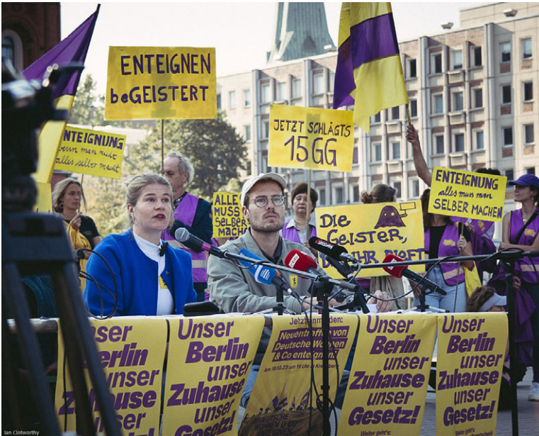
Figure 3.5 DWE announces the second referendum in front of the Rotes Rathaus (Berlin City Hall), 23 September 2023

Wegner of the Christian Democrats (CDU) – have opposed socialisation. Their resistance is hardly surprising: both their parties have been receiving campaign funding from the real estate lobby. The only way to bypass the government’s inaction is to write the law ourselves and put it to a direct vote.