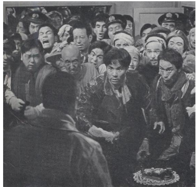
Strike the Hour