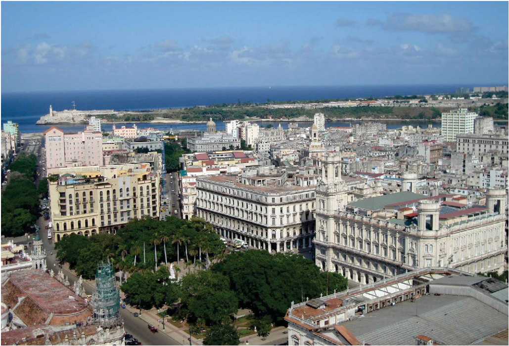
Figure 1. View of the Havana Old Town Central Park and port entry