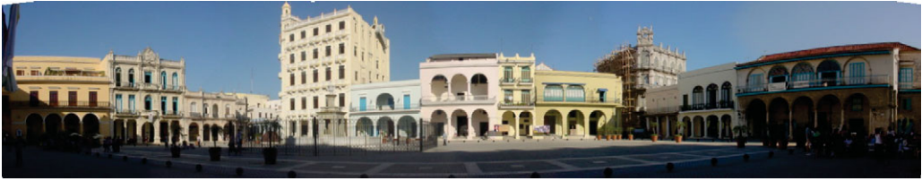
Figure 2. Panoramic view of the Plaza Vieja. The pink painted building at the centre is the location where the Planetarium is going to be placed

The Office of the Historian of the City of Havana whose corporate purpose is the one of contributing to the knowledge of the history and the culture of the nation, to preserve the symbols, material and spiritual expressions of the Cuban nationality included in the patrimony to its care and to make them useful when propitiating its knowledge and understanding.