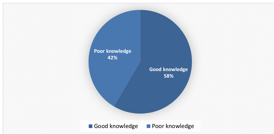
Table 2. Knowledge of EHCPs towards Prehospital Care in the Three Selected Prehospital Emergency Medical Service Institutions in Addis Ababa, Ethiopia, 2022 (n = 135) Abbreviation: EHCP, Emergency Health Care Provider.

Mamo © 2023 Prehospital and Disaster Medicine