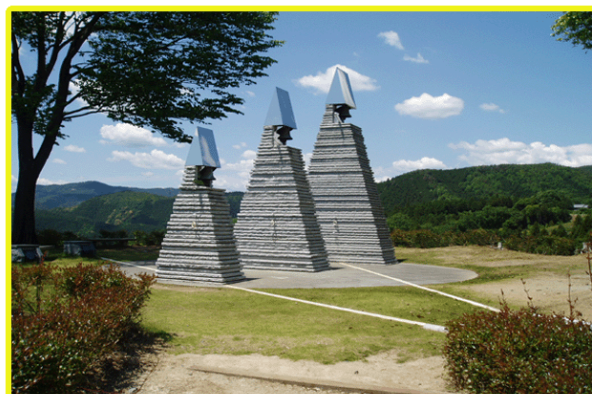
Sculpture at the Yaotsu Memorial representing visas

While Sugihara’s family and others were crafting Sugihara’s memory by writing, in the early 1990s his hometown, Yaotsu, decided to give his memory a more three-dimensional aspect. They set the wheels in motion to create a memorial place and time [2] for him. Within a few years a memorial site—consisting of a monument and a small memorial hall dedicated to Sugihara and his story—was built on a hill in town. Naming it the Hill of Humanity, and constructing a large park, the planners invited visitors to remember Sugihara by the catchword of humanism [3].