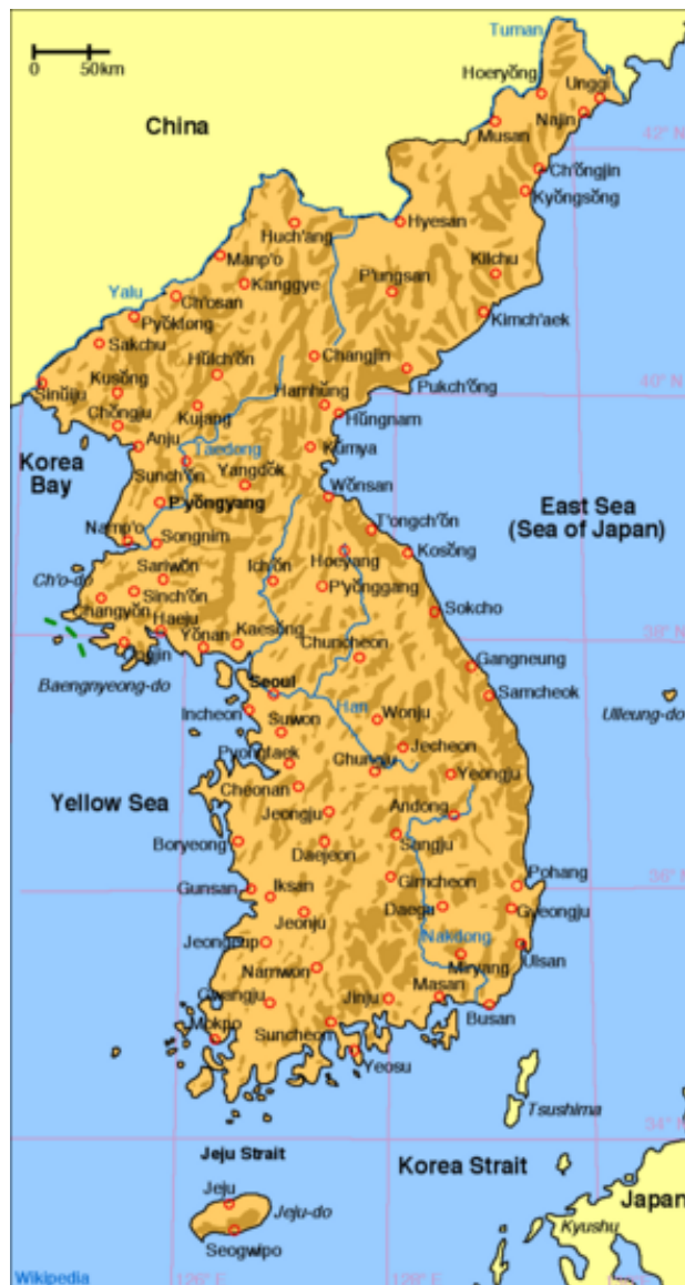
Map of the Korean Peninsula

open to the peoples with which they came in contact, while the island was politically subordinated by its larger land-based neighbours. This openness, in conjunction with political subordination, did not mean that Jeju Islanders assimilated. Rather, they managed their political and cultural relations so as to maintain a measure of autonomy and cultural distinctness. This history of Jeju Island contributes to the understanding of the nation-state from the perspective of minority ethnic groups, especially those living across territorial borders.