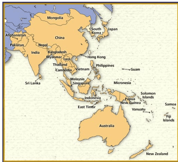
Map of the Western Pacific

Despite centuries of subjugation by larger neighbours—Joseon Korea, Imperial Japan, and South Korea—Jeju island society has maintained a distinct identity and a measure of autonomy. Relations with both Korea and Japan have at times had devastating effects on the islanders, but also contributed to the dynamism of Jeju island society and opened up new routes for islanders to continue traveling as a vital part of their social life.