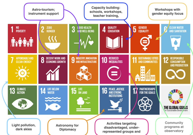
Figure 2. Potential contributions of astronomy to the SDGs.

industries and NGOs, art and cultural organisations. Indeed, an important goal of the OAD is to position young people for non-academic job opportunities in which they can apply the skills they have acquired in their career so far, as they are often in high demand. The field of astronomy can lead other sciences in terms of the societal benefits of blue skies research, and also with regard to the value that science brings to challenges facing humanity. The OAD can be a ‘working space’ for collaborations across sciences. The recent merger of the ICSU and ISSC clearly promotes such an approach.