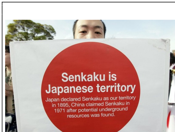
A Japanese demonstrator in a December 2010 Tokyo demonstration