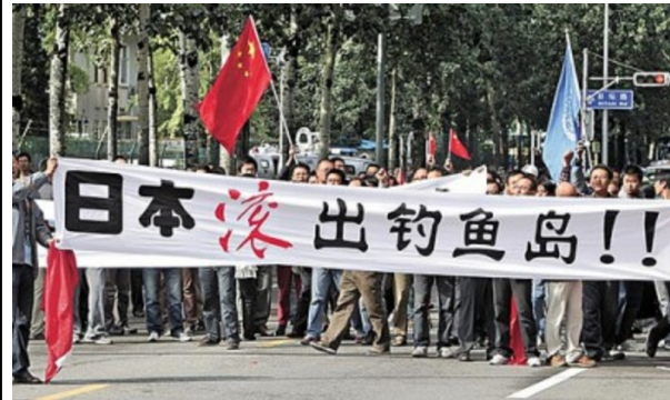
Chinese demonstrators on September 18, 2010 at the Japanese Embassy in Beijing

In this fashion, the Bao-Diao Movement in the Chinese sphere has risen and fallen, to rise again, in response to developments of recent history. One wonders how clearly the ruling Democratic Party of Japan understands this background and prevailing conditions.