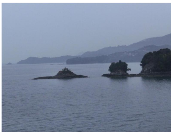
Minamata Bay in winter.

Every philosophy and every social theory is culturally and historically specific. While the impact of the increasing economic power of Asia is felt all over the world, as yet no ethical framework to support its sustainable development has been identified. Ogata's philosophy may provide a first step for us to start imagining a new way of perceiving everyday life for a different kind of modernity. And to do this may demand an epistemological change in the social sciences. But perhaps there is nothing new in that. Sociology did not exist before Durkheim established the concept, and the existence , of social phenomena ' sui generis ' that are independent of the actions and intentions of individuals in society. 109 Would it be going too far to say that recognition of the existence ' sui generis ' of the life-world might be the pre-condition for a new modernity where sustainable development is possible?