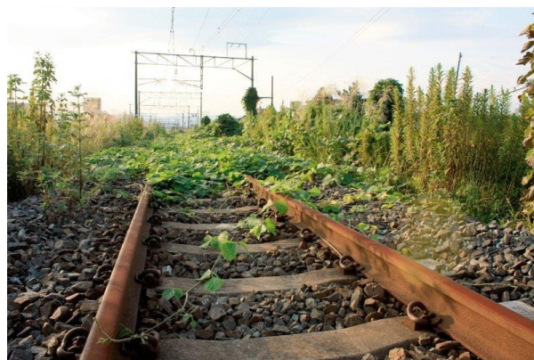
Namie became a ghost town

The crisis in Fukushima is even more serious in many respects. In Fukushima, the level of devastation is extremely high, and as at August 2012, approximately 111,000 people have been forced to evacuate by the government with no or limited prospects of returning to their homes. 35 The impact of the nuclear crisis is global rather than regional, and in respect of the ecosystem, it is not yet possible to determine its ultimate impact. The underlying power structure of the Japanese ‘nuclear village’ is more formidable than that of Chisso. Its power is reinforced by close links to the international nuclear regime. The causal link between exposure to the poison and illness is much harder to establish in the case of irradiation: low level irradiation does not result in distinctive symptoms as in Minamata disease; it takes many years to manifest as cancer, the cause of which is difficult to single out; and impact upon the unborn, infants and young children is unknown.