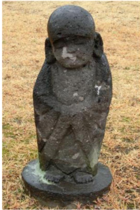
A Stone Buddha on the reclaimed land in Minamata.