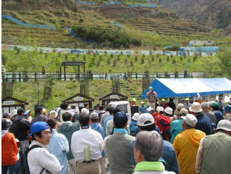
FIG. 4: Meeting of the Ashio Green Growing Association, 2002.