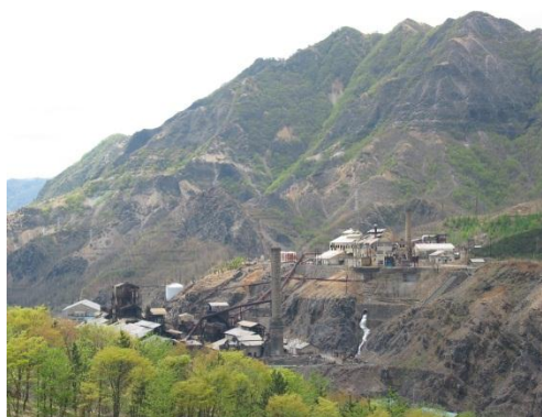
FIG. 3: Remains of the Ashio Refinery, 2002.

At Ashio itself, every year hundreds of volunteers from Ashio Green Growing Association ( Ashio ni Midori o Sodateiru Kai ) assemble near the remains of the Ashio refinery in an attempt to replant the mountainsides. This process is slow and requires much experimentation as the soil still contains large amounts of sulfur left by one hundred years of toxic smoke from Ashio’s stacks.