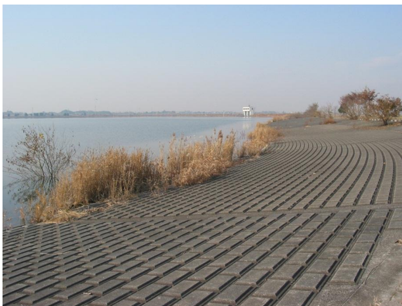
FIG. 6: Concrete bank of the Yanaka Reservoir, 2002.

Given this history, it is interesting to note the discourse on dams in modern Japan where new construction or removal maps so closely to bureaucratic initiatives, on the one hand, or citizen-led ones, on the other. From former Nagano governor Yasuo Tanaka's "Dam Removal Declaration" ( Datsu damu sengen ) to the citizens' groups forming in opposition to the Arase and Nagara dam projects, the convergence of river policy and political and social movements remains strong. Outside Japan the saga of dams and displacement continues on an even larger scale. Like Tanaka's warnings nearly one hundred years earlier, Arundhati Roy's The Cost of Living (1999) takes on the "illusions of India's progress" in a polemic against the massive dam projects in the Narmada valley as India strives toward Great Power status—which today means not only large nature-transforming projects but also means the risk of unleashing the ultimate doku : nuclear weapons. [12]