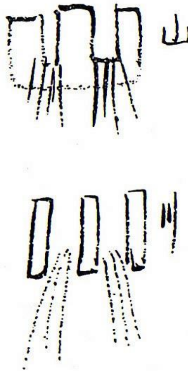
FIG. 2: A Tanaka diary entry from 26 Jan 1912.

To prevent doku and to foster life, humans needed to learn how to organize themselves in a way that lets them take advantage of the benefits of a freely flowing ecosystem. A diary entry from 26 January 1912 shows Tanaka playing with the Japanese characters for mountain ( yama ) and river ( kawa ) to illustrate the complementary relationship of the land and water in fostering flow. Tanaka's own caption read: "These diagrams express the principle of nature. River managers who understand the meaning of these pictures are rare indeed."