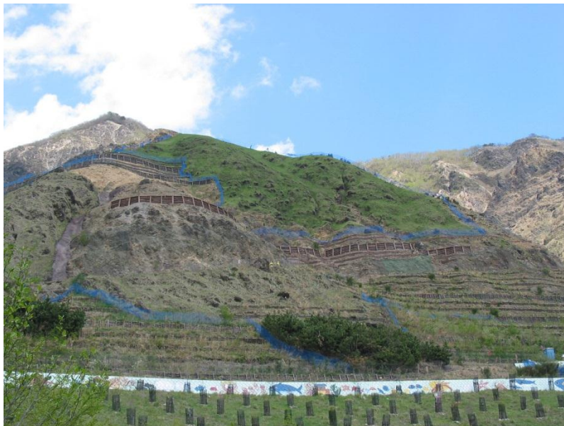
FIG. 5: Experimental reforestation at Ashio: The green zone at the top is a mix of soil, seed and fertilizer sprayed onto the rock in an attempt to compensate for the lack of topsoil.

In a great historical irony, the Yanaka reservoir has become a place of “nature recreation” and its brochure features a cartoon windsurfer enjoying the open water. Yet even while the banks of the reservoir today appear natural, their earthen facades are built on a base of hard-engineering and concrete.