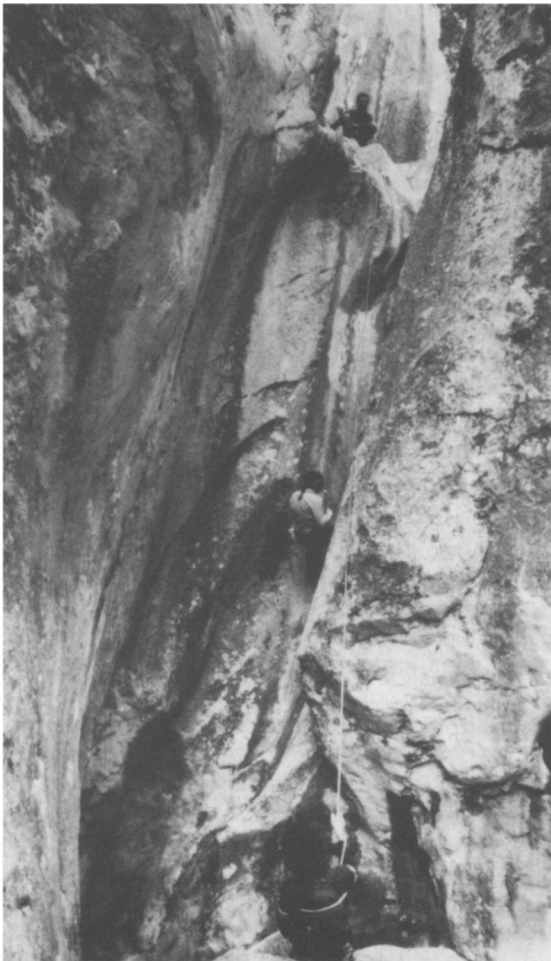
Abseiling in the gorges in search of the midwife toad ( Simon Tonge ).