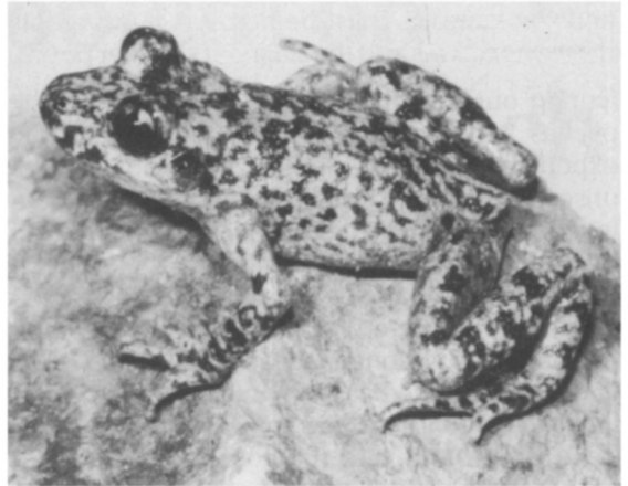
Mallorcan midwife toad.

water were unfounded. The pond is 15 minutes' walk from the track where we had left our vehicles, and is about 50 sq m in size. To our surprise, it contained about 200 large tadpoles, which we estimated to be two or three years old. Apparently, some specimens do not metamorphose at the end of their first summer for reasons that are, as yet, unknown. This was a great relief to me as I realized that, even if I could not get adult toads, I could take tadpoles and try to get them to metamorphose in Jersey. Shortly after our arrival at the pond we heard a male calling, and by the time we left, two hours later (at about 17.00 hrs), we estimated that there were perhaps 50 males calling.