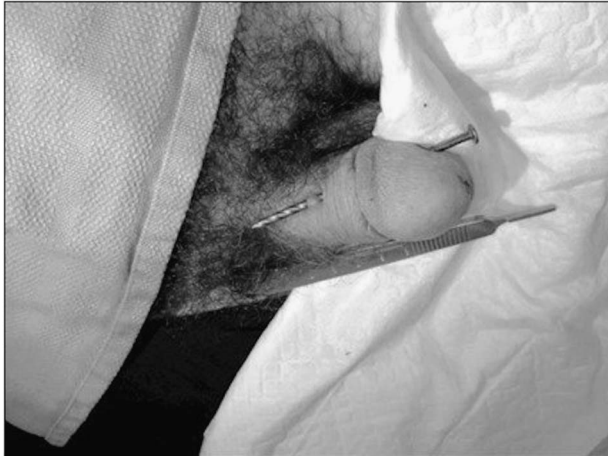
Figure 1. Picture illustrating an unintentional nailgun-inflicted penetrating penile injury sustained at a construction site.