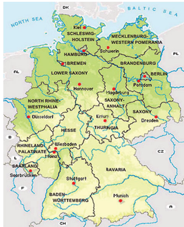
Fig. 1 [colour online]. Map of Germany showing the federal states (source: http://www.nationsonline.org/maps/german_states_map.jpg ). Accessed 2 October 2012.

The experimental procedures on the animals were performed in accordance with the principles outlined by the European Convention for the Protection of Vertebrate Animals used for Experimental and other Scientific Purposes. The blood samples were taken by veterinarians of the University of Veterinary Medicine Hannover, Foundation.